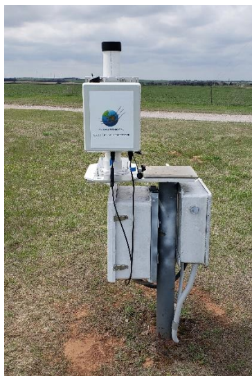
Figure 1. TWST (early prototype) deployed at SGP.

Figure 1 shows TWST early prototype originally deployed at SGP in the optical cluster region, just outside the optical trailer. TWST consists of the top box along with its PVC mounting post and flange. The other boxes are part of the permanent SGP installation. The instrument software runs on a laptop computer located in the optical trailer. Communication to the instrument is via a USB extender.