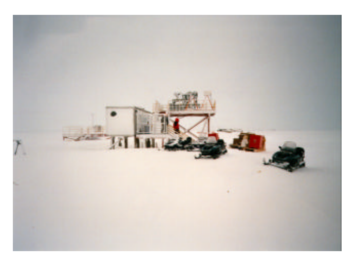
Figure 3 . The main ARM instrument shelter on NOAA land as the instrumentation was being installed. (For a color version of the figure, please see <a href="http://www.arm.gov/docs/documents/technical/conf">http://www.arm.gov/docs/documents/technical/conf</a> 9803/zak-98.pdf.)

In addition, both in situ and remote sensing instrumentation is in place to document the instantaneous state of the atmosphere above the CART site (Figure 3). This instrumentation includes a micropulse lidar (MPL) for measuring cloud base, cloud and atmospheric characteristics; a zenith-staring millimeter cloud radar (MMCR) for recording the vertical distribution of clouds even when multiple layers are present; a multi wavelength whole sky