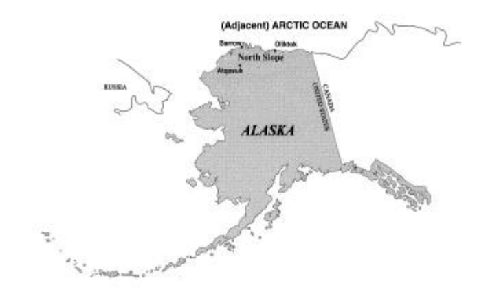
Figure 1 . Location of the Barrow ARM NSA/AAO facility. Atqasuk and Olikotok are other locations within the ARM NSA/AAO locale where additional ARM instrumentation may eventually by located.

On July 1, 1997, the ARM NSA/AAO CART site was dedicated by local North Slope officials and by Dr. Martha Krebs, who heads the U.S. Department of Energy's (DOE's) Office of Energy Research. The main facility is located near Barrow, Alaska, and has its sensors on National Oceanic and Atmospheric Administration (NOAA) land adjacent to the NOAA Climate Monitoring and Diagnostics Laboratory (CMDL) Barrow station (Figure 1). The NOAA land borders the Barrow Environmental Observatory (BEO) (Figure 2), an area protected from development and set aside for environmental research by the Ukpeagvik Inupiat Corporation (UIC), the corporation owned by the native residents of Barrow. Management of the BEO is supported in part