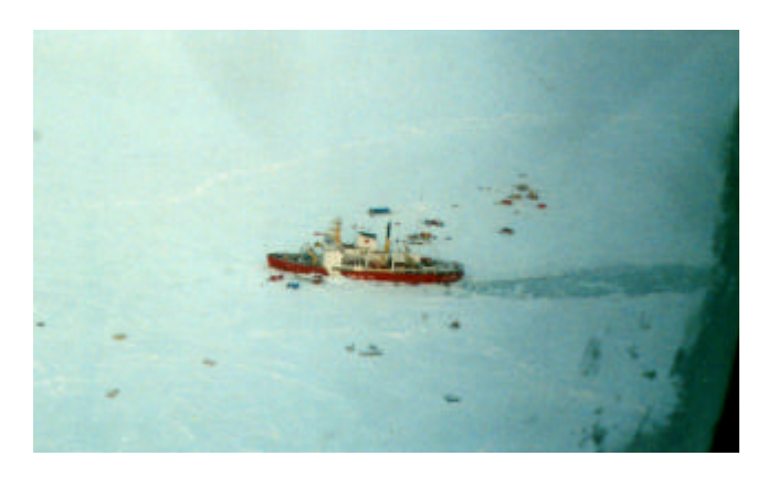
Figure 4. Aerial view of the Canadian icebreaker Des Groseilliers with the SHEBA encampment growing around it shortly after it was moored to the ice. (For a color version of the figure, please see <a href="http://www.arm.gov/docs/documents/technical/conf_9803/alberta-98.pdf">http://www.arm.gov/docs/documents/technical/conf_9803/alberta-98.pdf</a>.)

FIRE [First International Satellite Cloud Climatology Project (ISCCP) Regional Experiment] Arctic Cloud is a National Aeronautics and Space Administration (NASA)