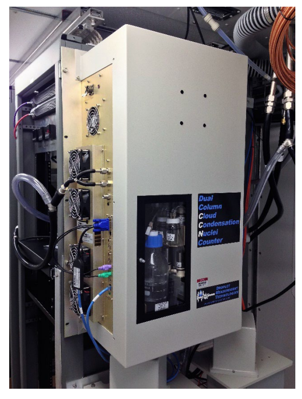
Figure 1. The cloud condensation nuclei counter (CCN-200 model).

along with dual flow systems and electronics. As of writing this handbook, ARM only deploys the dual-column instrument, CCN-200. Details of the CCN-100 have been left in this handbook for informational purposes about historic measurements.