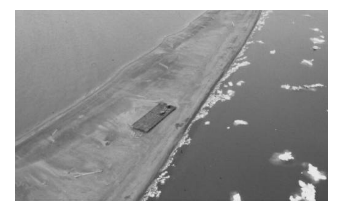
Figure 2. Grounded barge on Crescent Island proposed for use as an instrument platform.