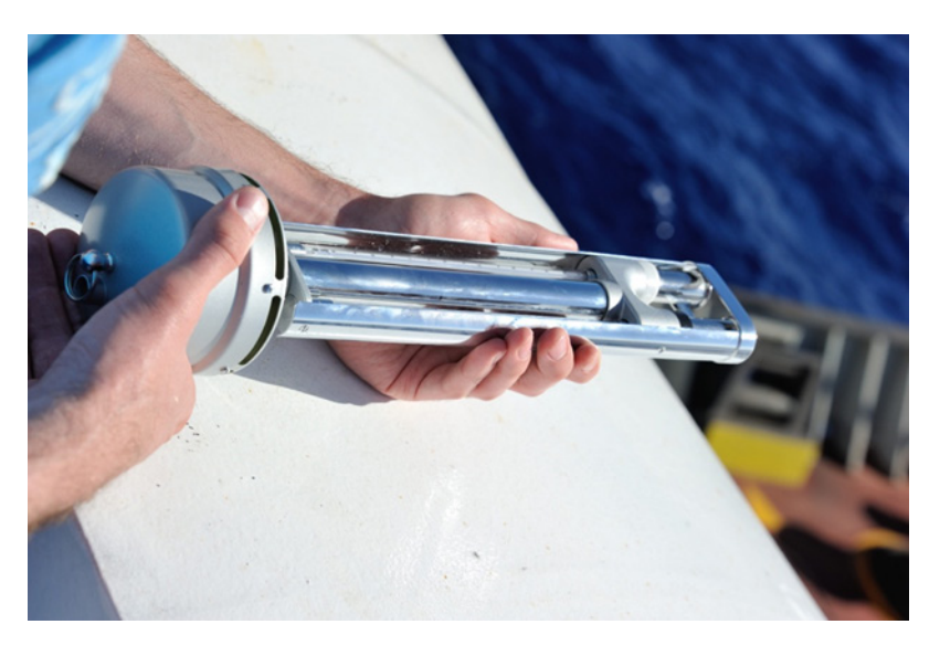
Figure 1. Assmann psychrometer, Model 430101, used in the MAGIC field campaign.

One of the most critical measurements in the suite of meteorological measurements used for the calculation of evaporation and latent heat flux is the relative humidity (RH). In order to achieve an overall net flux uncertainty < 10 W/m^2 (Bradley and Fairall, 2006), the RH must be accurate to < 2 %RH. Anyone experienced in shipboard meteorological measurements will recognize that this is a tough specification.