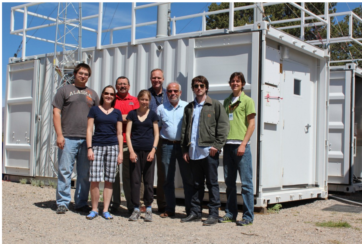
Figure 1. The PACE team.

Between December 2011 and April 2012, a team of researchers (see Figure 1) from Los Alamos National Laboratory (LANL) worked on the Pajarito Aerosol Couplings to Ecosystems (PACE) intensive operational period (IOP). PACE's primary goal was to demonstrate routine Mobile Aerosol Observing System (MAOS) field operations and improve instrumental and operational performance. LANL operated the instruments efficiently and effectively with remote guidance by the instrument mentors. This was the first time a complex suite of instruments had been operated under the ARM model and it proved to be a very successful and cost-effective model to build upon.