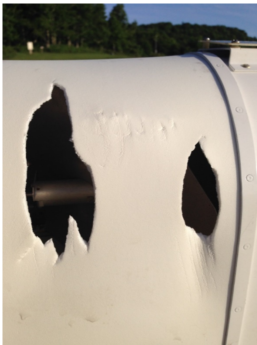
Figure 4. Bear damage to MWR2C radome.

We eventually moved the location to the rooftop of a nearby building. We also had trouble with malfunctioning equipment, which caused some periods of missing data while we had receivers replaced.