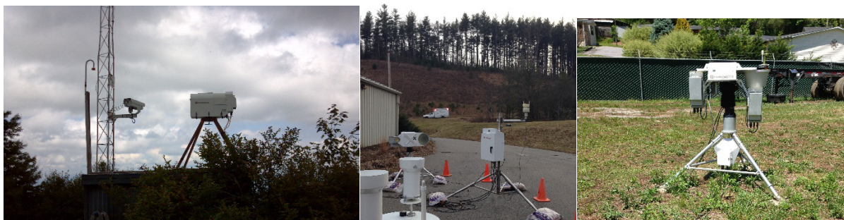
Figure 1. Left to right: MWR2C, eastern MWR3C, and inner region valley MWR3C.

The deployments of the Microwave Radiometers (MWRs) lasted from February 2014-January 2015, with some missing periods that are discussed in Section 3.0. The three setups are pictured in Figure 1.