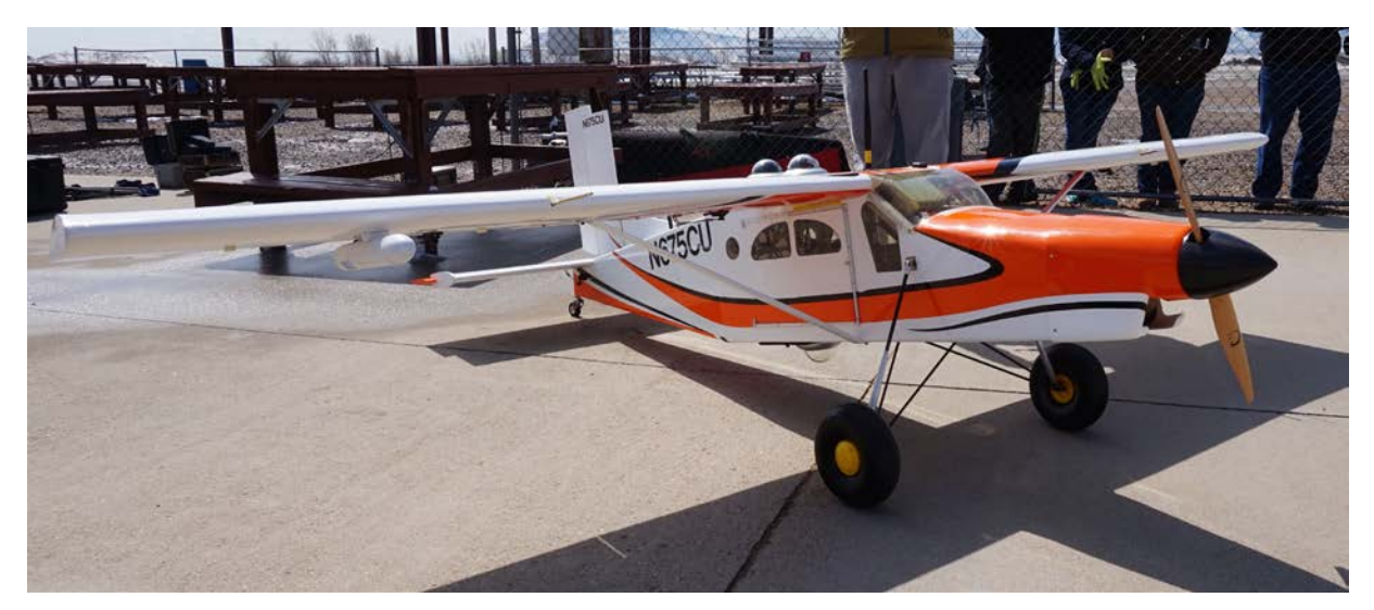
Figure 2. The Pilatus UAS shown equipped with the PTH module (white, on wing), SPN-1 Shortwave Pyranometers (two upward and one downward looking), and the POPS Aerosol Spectrometer (in windshield).

configuration will feature the POPS, the PTH module, and two Kipp and Zonen CGR-4 pyrgeometers (broadband longwave radiometers). This will include one upward- and one downward looking CGR-4.