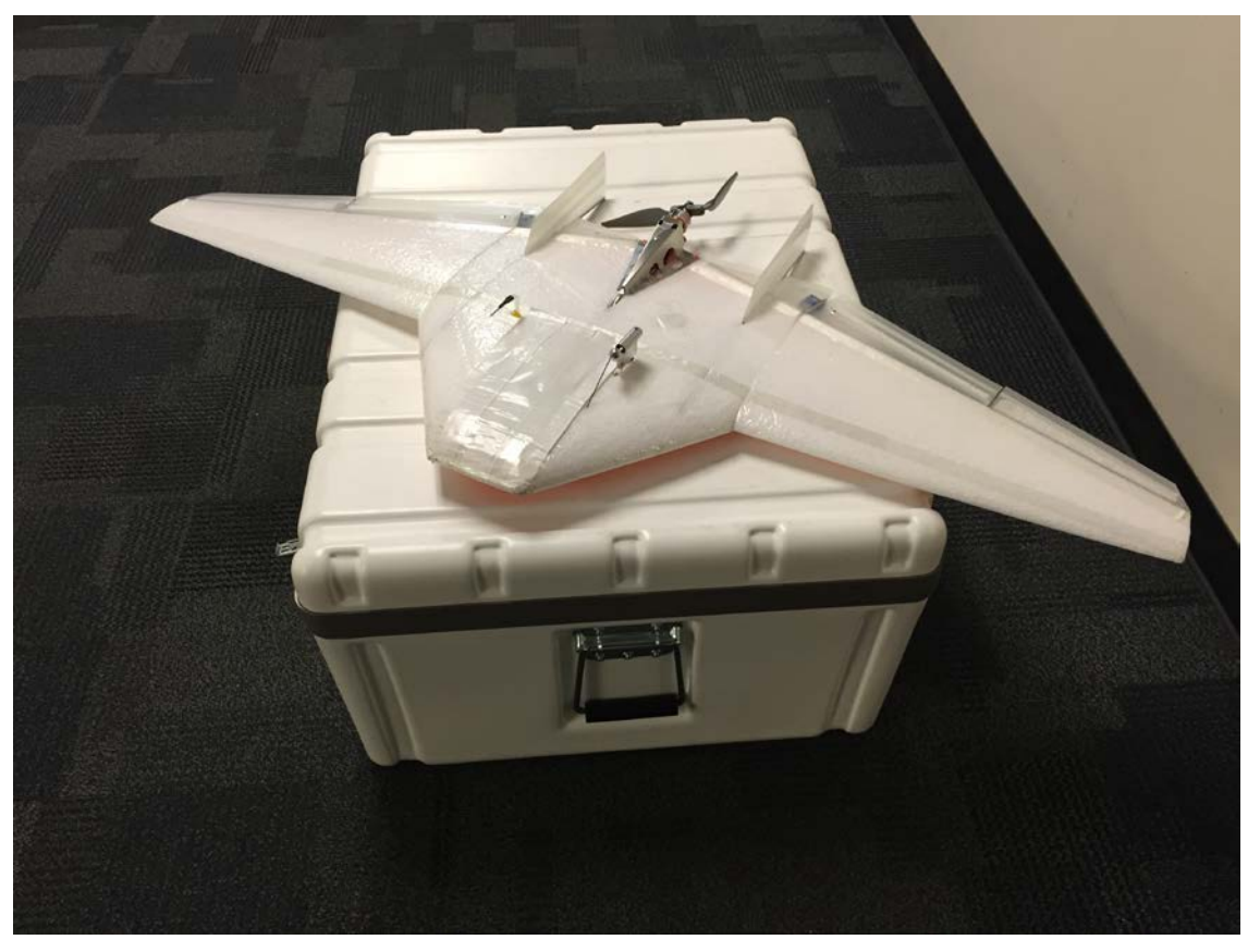
Figure 1. DataHawk UAS shown on top of its shipping container.

The DataHawk is capable of fully autonomous operation from launch to landing. The system is guided by the CUPIC autopilot during flight, allowing for the establishment of preprogrammed waypoints to aid navigation.