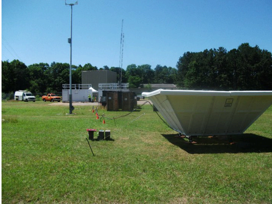
Figure 1. 915-MHz RWP deployed in the BNL aerosol life cycle IOP.