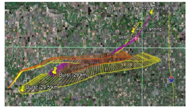
Figure 1 . AirCore flight string, balloon launch, and flight trajectory. Top: The AirCore balloon string is made up of several modules including the AirCore/data logger, MET, Iridium transmitter, cutter, and parachute modules. Bottom left: Balloon launch in January 2012, from Medicine Lodge, Kansas. Bottom right: Flight trajectory in January 2012, from Carrier, Oklahoma.