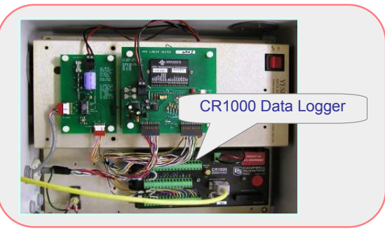
Fig. 2: Data acquisition system for the MFRSR instrument

The application can be compiled in any UNIX environment supporting C++ and STL. Currently supports RS-232 communication. Support for TCP/IP based collection can be added in future.