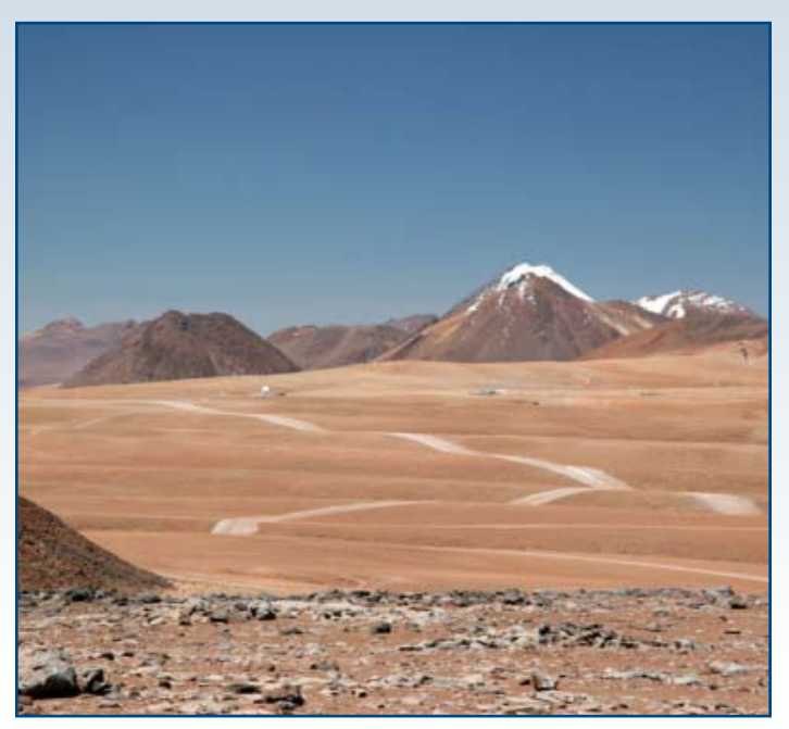
The arid atmosphere above the Chajnantor Plateau is ideal for obtaining measurements from the upper troposphere that are so important for modeling Earth's climate.

The Electromagnetic Spectrum. All objects emit some amount of energy, or radiation, in the form of electromagnetic waves. The length of the waves corresponds to the amount of energy emitted; shorter wavelengths correspond to more energy and longer wavelengths to less energy. The entire range of this energy is referred to as the electromagnetic spectrum. From a climate perspective, the important portions—or bands—of this spectrum are the ultraviolet, visible, and infrared. During RHUBC-II, scientists are using spectrometers to measure the radiative energy in the infrared portion of this spectrum.