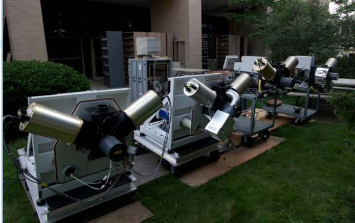
The Atmospheric Emitted Radiance Interferometer, developed specifically for ARM, is a sensitive infrared spectrometer covering the wavelength range from 3.3 to 18 microns to measure downwelling radiance at high spectral resolution. High temporal resolution profile of temperature and humidity are retrieved from these infrared spectra.

The PECAN experiment is a collaboration between the National Science Foundation (NSF), National Oceanic and Atmospheric Administration (NOAA), National Aeronautics and Space Administration (NASA), and the U.S. Department of Energy's Office of Science. Through its support of ARM and other national user facilities, DOE's Office of Science is the single largest supporter of basic research in the physical sciences in the United States and is working to address some of the most pressing challenges of our time.