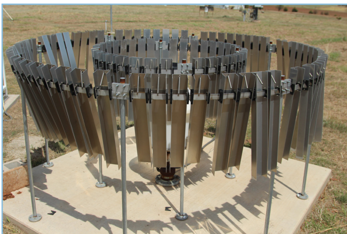
The tipping bucket rain gauge measures the cumulative rainfall over a period of time.