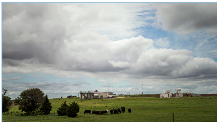
Radar row, located on the SGP site, is a series of radars used to measure a variety of atmosphere ice properties. Due to the narrow antenna beamwidth, ARM's scanning cloud radars utilize scanning strategies that are unlike typical weather radars.

Unique to this campaign, there will be six fixed PECAN Integrated Sounding Array (PISA) sites and four mobile PISAs that will be moved nightly to find the best opportunity for rain activity. The ARM Facility is providing five AERIs, which will be deployed at the fixed PISAs. This set of instruments will provide a uniform and consistent thermodynamic data set, greatly improving the ability of